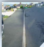
Example of a Grade 'A' Street

Another performance measure is the time taken for us to remove fly-tipped material, and we are developing other measures to support our aim in reducing fly-tipping within the local area.