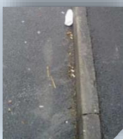
Example of a Grade 'B' Street