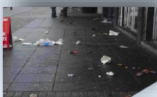
Example of a Grade 'D' Street