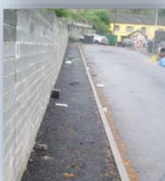
Example of a Grade 'C' Street