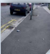
Example of a Grade 'B+' Street